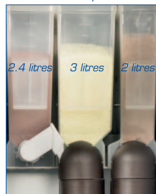
Canisters with different capacities

Easy to install on the base cabinet due to the new and functional prearrangement. Available in basic (empty) and equipped versions (with solid and liquid waste containers). A bill validator can be installed in the base cabinet.